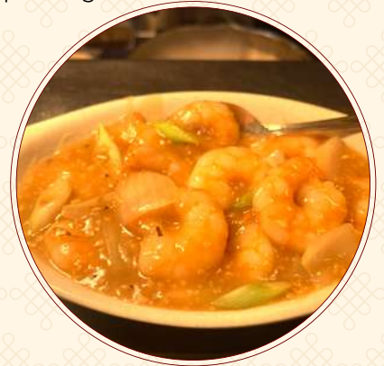
King Prawns in Garlic Sauce* 蒜子虾球*