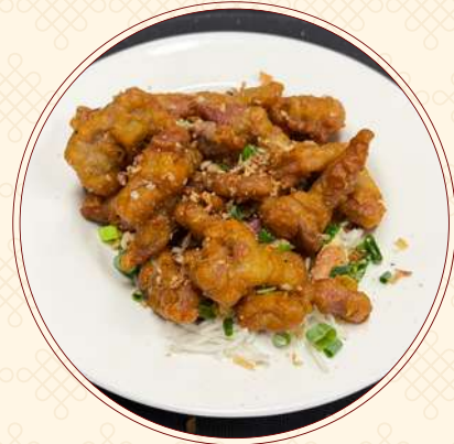
Salt & Pepper Pork Chops 椒盐猪扒