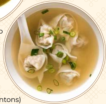
Short Soup (Wontons) 云吞汤