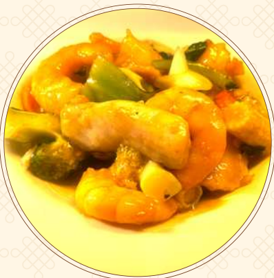
Steamed Barramundi Fillet with Ginger & Shallots 葱姜蒸鱼片