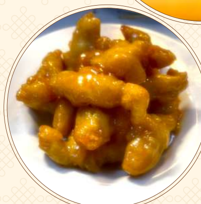
Boneless Lemon Chicken 柠檬软鸡