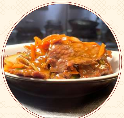
Fillet Steak in Peking Sauce 京汁牛柳