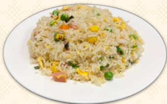
Fried Rice* 炒饭*