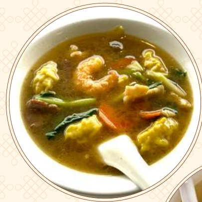
Combination Short Soup 杂烩云吞汤