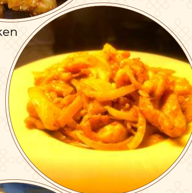
Satay Chicken* 沙爹鸡*