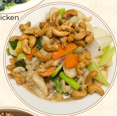
Braised Chicken with Cashew Nuts* 腰果鸡*