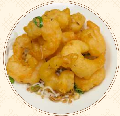
Salt & Pepper King Prawns* 椒盐虾球*