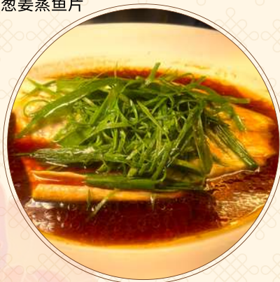
Steamed Barramundi Fillet with Ginger & Shallots 葱姜蒸鱼片