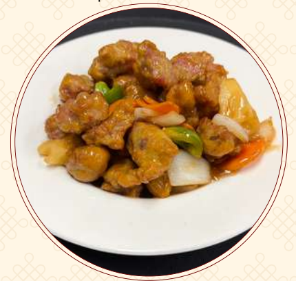
Sweet & Sour Pork 咕嚕肉