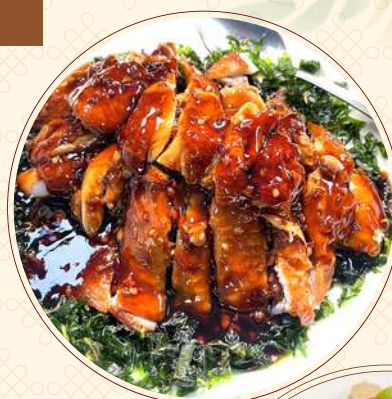
San Tung Chicken 山东鸡

Chicken with Seasonal Vegetables* $22 时菜鸡*