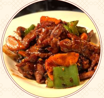
Beef in Black Bean Sauce* 豆豉牛肉*