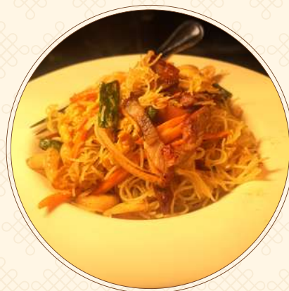
Singapore Noodles* 星洲米粉*