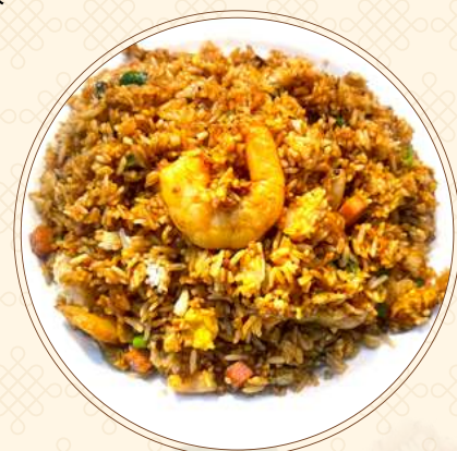
Special Fried Rice* 什锦炒饭*