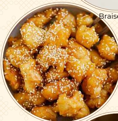
Honey Chicken 蜜糖鸡