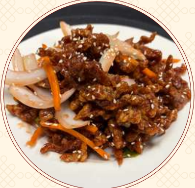
Crispy Beef in Peking Sauce 京汁干烧脆牛柳