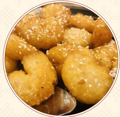
Honey King Prawns 蜜汁虾球