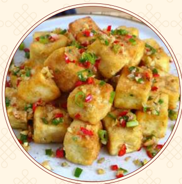
Salt & Pepper Tofu* 椒盐豆腐*